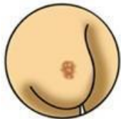
Change in how the nipple looks, like pulling in of the nipple