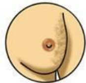
Change in skin color or texture