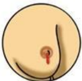
Clear or bloody fluid that leaks out of the nipple