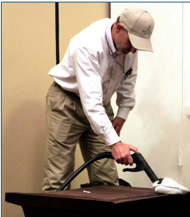
Experienced professionals use a variety of control techniques. This bed bug control technician is using steam to kill bed bugs and their eggs on the back of a dresser.

Ask who will be treating your home or business, how they will be supervised, and if they are specifically trained for bed bug control. Find out how long the service will take and if more than one technician will be involved. Initial treatments can take four or more hours, especially when beds and heavy furniture must be moved. A team of two or more can treat more thoroughly; one of the technicians should be highly experienced.