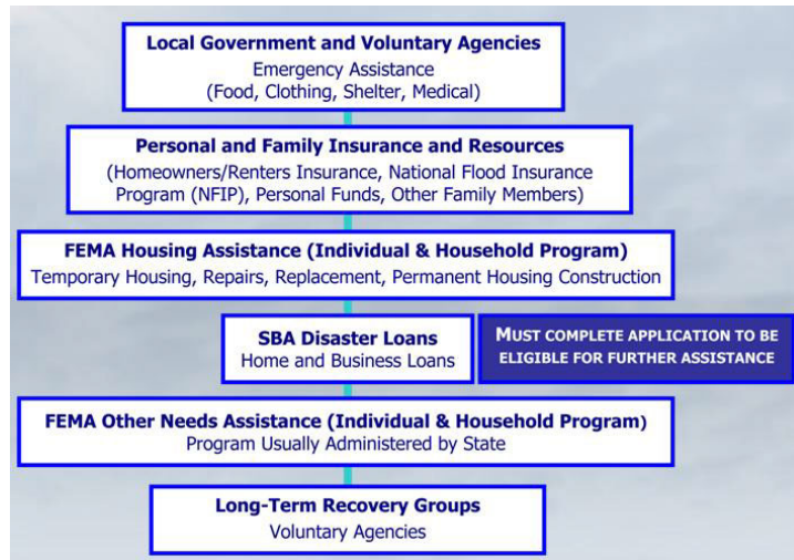
(CWS staff art)

Faith-based disaster case managers cultivate close relationships with survivors but maintain a healthy professional distance from them to assure that all information surfaces about their needs. They work proactively, seeking out individuals and families and advocating on their behalf with other agencies. Secular agencies also do disaster case work, but the faith community often provides an added “helping” dimension. Training such as that offered by the United Methodist Committee on Relief (UMCOR) is essential.