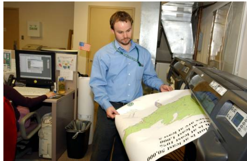
Disaster preparedness starts with collecting and analyzing information and encompasses creation of organizational structures, acquiring necessary equipment, appropriate training, testing plans and adjusting them as required.