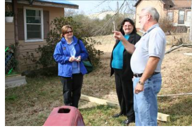
CWS Emergency Response Specialists train and mentor local long-term recovery leaders and work with care-giving agencies in developing special projects.

assist through material resource shipments, training and mentoring of local long-term recovery leaders, and working with care-giving agencies in developing projects geared to vulnerable populations. They support and strengthen state and community inter-religious organizations, facilitate cooperative activity of faith groups in disaster preparedness/mitigation/response/recovery and build relationships with FEMA, the American Red Cross, other response agencies, and VOADs. They are also sources of public information on the role of the faith community in disaster response and recovery.