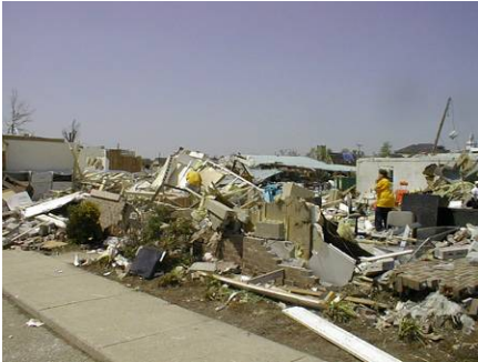
The religious community assists in cleanup, repair, and rebuilding. It coordinates volunteers and advocates for those who cannot speak for themselves.

God, as in Jesus Christ -- in the midst of the “hell” a disaster produces -- particularly for those who are most vulnerable to the effects of the disaster. Bringing hope and order to the chaos.