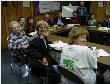
A congregational disaster preparedness planning team should include people with special concerns about property protection, continuing service, membership care, repairing/rebuilding damaged property, and service to the wider community.