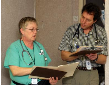
In preparing to serve their communities in public health emergencies, congregations need to learn about the work of state and local health departments.