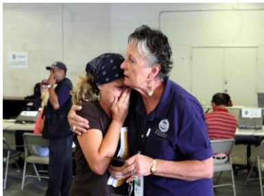
Emotional-spiritual care offers disaster survivors safety and security, an opportunity to ventilate, and reassurance.

When basic trust is threatened, there is confusion. Added to a wide range of possible feelings, including anger, bereavement, and pain, is an uncertainty about what might happen next. Where basic trust is severely weakened the most significant thing you can do is help the survivor start re-establishing the building blocks of basic trust by offering: