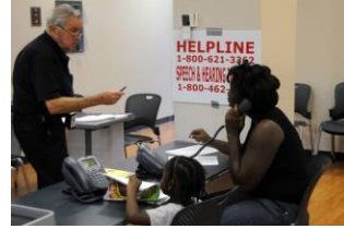
Your congregation can help its members and community residents apply for the assistance to which they are entitled from government and other care-giving agencies.