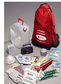
Families should assemble an emergency evacuation kit including water, food, clothing, blankets, first aid kit, radio, flashlight, cash and credit care.