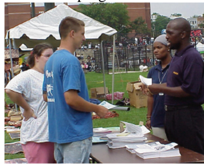
During the short-term recovery stage following a disaster, survivors learn about assistance programs of varied agencies and apply for aid at Disaster Assistance Centers.

If the President declares the disaster-affected area eligible for federal assistance, FEMA activates a variety of assistance programs by calling up varied federal agency-managed Emergency Response Functions (ESFs) such as the Mass Care, Emergency Assistance, Housing, and Human Service functions to address disaster needs. In partnership with the state, it establishes a Joint Field Office (JFO) where Federal and state ESFs are administered.