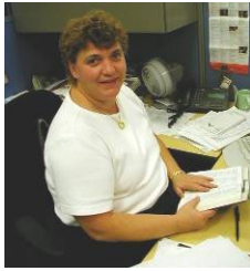
Church World Service Emergency Response Specialists train and mentor long-term recovery leaders and work with local groups on special projects.

CWS is a registered non-governmental organization (NGO) with the U.S. Government and a member of National Voluntary Organizations Active in Disaster (NVOAD) and Interaction -- an international coordinating agency. In addition to worldwide disaster response, CWS works with partner organizations in development projects around the world, assists immigrants and refugees, conducts public education on global poverty and social-economic development issues, and raises funds to assist the poor and vulnerable through its CROP Walks for Hunger. Your denomination/communion and affiliated agencies support CWS and look to it to provide leadership in the ecumenical or interfaith communities on their behalf.