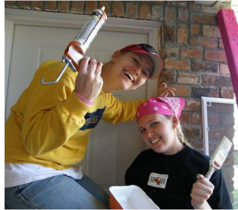
You and your congregation can make an important contribution in helping people recover from disaster. This manual shows you how.

Scripture is filled with examples of the people of God preparing for disasters, responding to them, and rebuilding after disaster strikes. In Exodus, the detailed instructions of how the Israelites are to prepare the Passover meal and gather their household in anticipation of the catastrophic events mirrors the same preparations we make today. Jesus feeding the 5000 reminds us of the both the compassion and the community resiliency aspects of the relief stages of disaster response. And finally, the story of Nehemiah rebuilding the wall around Jerusalem demonstrates that the need to work collaboratively, develop recovery programs that include the people affected by the disaster.