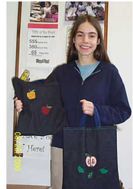
Congregations can assemble Church World Service Kits and Emergency Clean-up Buckets, donate the cash value of kits or buckets, and contribute cash to the Blankets+ Program to respond to the kinds of material donations requests often received following disasters.

Be specific when requesting donations. Spread the word about appropriate donations via your church bulletin or newsletter and bulletin boards. Display items on a table, through a slide show, or in photos.