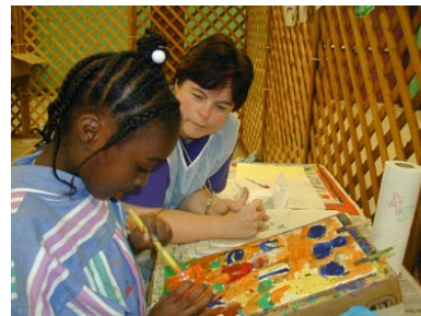
Disaster child care is specialized spiritual-emotional care that recognizes children and youth respond differently than adults to traumatic events.