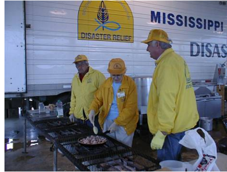
A congregation with a healthy every-day service ministry need look no further than its regular programs to begin helping its members and people in the community.

In the early stages of a disaster, local government agencies – following an Emergency Operations Plan (EOP) and coordinated by an Emergency Operations Center (EOC) in large disasters -- are the major players. They issue public warnings, evacuate people to temporary shelters, and protect life and property. At this time, members of your congregation should focus on themselves and their property and stay out of the way of police, fire, search and rescue, and medical personnel. They should secure themselves and their families, evacuate if necessary, and take other protective measures.