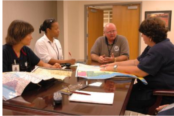
Organizing a long-term recovery group involves developing a mission statement, projecting program needs, building a budget, fundraising, planning for volunteer coordination, and partnering with the government and other helping agencies.

Information & Resources: As the transition from agency-based to community based recovery unfolds, Church World Service (CWS) Emergency Response Specialists (ERSs) can offer local groups important guidance through training and mentoring. Denominational disaster recovery organizing consultants trained by CWS are also available to counsel religious leaders and accompany them through the recovery organizing process.