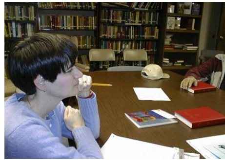
Assist without regard to a person's faith, religious affiliation, or membership in any group. Favoring one group over another creates hard feelings that have a life far beyond response and recovery.

Congregations may also work with survivors through a formal case management process that includes: