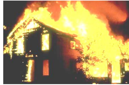
In disasters, something that should not have happened did happen and survivors may lose the basic trust that enables them to function.

The time a survivor had to prepare physically and emotionally for the disaster and the predictability of the losses affect the nature of the spiritual care required. A flood survivor, who knew the river was rising and had only loss of carpeting, will often be able to say, “That’s life.”