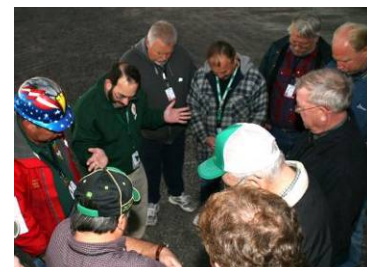
Prayer should never be forced. Pray only for those needs and things that will increase comfort and healing of the survivor.