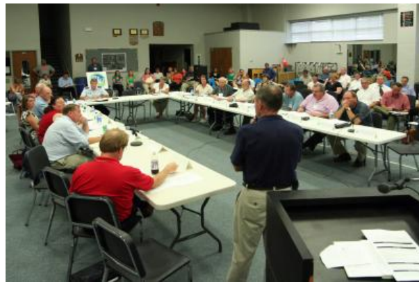
FEMA and state/local VOADs call meetings of care-giving organizations to share information and begin to think about long-term recovery.

After a major disaster in your community, state and/or local VOADs and/or FEMA Voluntary Agency Liaisons (VALs) will call meetings of all care-giving organizations where they can share information and learn and about how the community was affected and the ongoing response. At these meetings, officials will also begin to look towards long-term recovery.