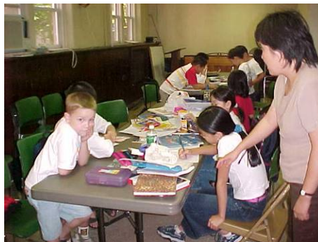
Congregations have special knowledge of vulnerable populations, such as children, that they can bring to disaster response in their communities.

Because members of the religious community have special knowledge of certain vulnerable population groups, understand spiritual-emotional care, and are recognized for leadership, advocacy, and reconciling roles in their communities, they may take on special ministries: