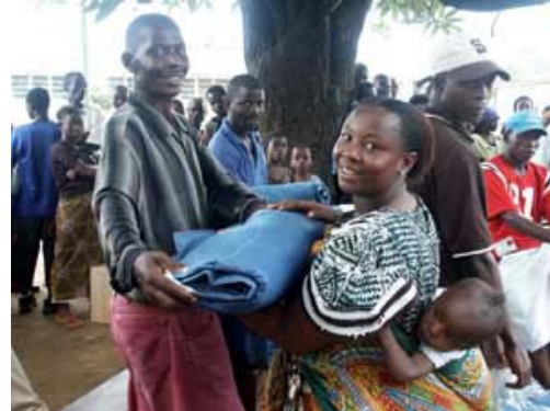
Match your capacity to assist with the need. What can you give?

In general, response occurs where (1) there are existing partners, related staff, or member denominations in an area (2) the affected disaster area has limited resources and (3) response activities give priority to vulnerable groups -- including children, mothers, older persons, disabled persons. In its response, CWS: