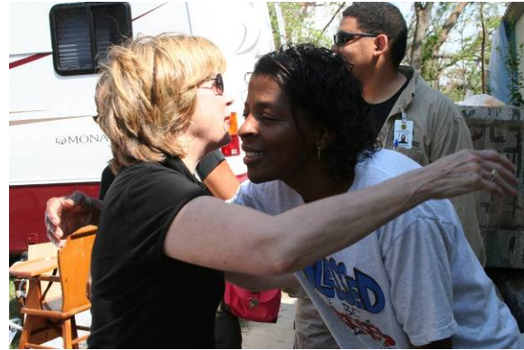
Disaster rescue workers, caregivers, and survivors need spiritual helpers to whom they can talk about what they saw, touched, smelled, heard, and felt – people who will listen to anger, hurt, frustration, and pain, and provide support.

Spiritual care is, of course, basic to the work of the religious community. Congregations bring people together to grow spiritually through study, worship, praying, singing, and sharing life's greatest moments, including tragedies, with each other. The nature of public trauma and catastrophe, however, thrusts it into a completely different and often unfamiliar dimension of service -- that of disaster spiritual care provider.