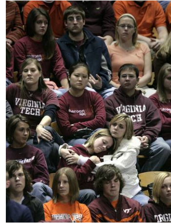
Following acts of public violence like the shootings at Virginia Tech, congregations can provide space for trauma victims to congregate, comfort each other, and receive appropriate spiritual-emotional care.

In recent years, terrorism – a political tactic that makes a statement, gains public attention, or seeks to destabilize the political-economic-social milieu -- has been categorized as a disaster. FEMA first started defining acts of terrorism as disasters following bombings of the World Trade Center in New York City in 1993 and the Alfred P. Murrah Federal Building in Oklahoma City in 1995.