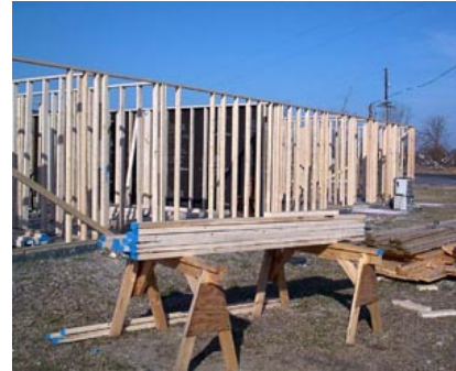
Mitigation tools include codes that require structures to be engineered to resist hurricane winds and earthquakes.