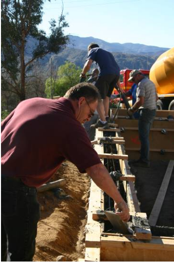
The faith community plays a special role in long-term recovery, focusing energy and resources on helping survivors rebuild their lives spiritually and physically. People of faith offer hope through spiritual care and hammer the nails in rebuilding and repairing homes.

The religious community plays a vital and unique role in meeting physical and spiritual needs in disaster-affected communities with particular focus on people with unmet needs who often fall through the cracks of assistance programs offered by government and other social service agencies.