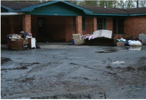
A congregation can make an important contribution in healing community trauma wounds by assisting other congregations whose buildings were damaged.