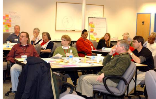
Reducing vulnerability to disasters starts with planning by people who know their community.