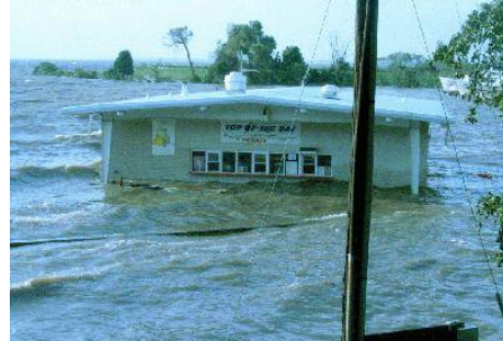
During disaster impact, local government assumes primary responsibility for response under guidelines of an Emergency Operations Plan.