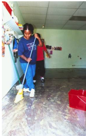
In the relief/remedy stage following a disaster, the faith community along with other care-givers helps create safe, sanitary and secure conditions for survivors.

Homeland Security agency which coordinates Federal response to disasters – may have pre-deployed teams to conduct a preliminary damage assessment (PDA) which the Governor of the state can use as a basis for requesting a Federal disaster declaration by the President.