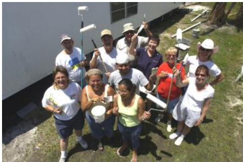
Religious and secular organizations in cooperation provide the greatest benefit to a disaster-affected community by avoiding duplication of services.

Perhaps most significantly in recovery, the source of assistance shifts from individual agencies with their own programs – both from inside and outside the disaster-affected community -- to efforts by community organizations through cooperative, collaborative, and coordinated programs. Congregations bring their activities around spiritual care,