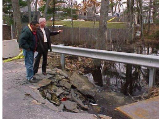
Shipping material goods may not make sense if roads are inaccessible or only open to emergency vehicles.