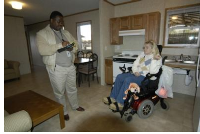
Include members of special populations, such as persons with disabilities, in your disaster planning process.

Training & Resources: Visit the Church World Service web site ( www.cwserp.org ) for information on disaster preparedness, in general, and including special populations in the disaster planning process. Contact the National Organization on Disability ( www.nod.org ), local emergency management agencies, and the American Red Cross for resources on family disaster preparedness.