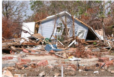
Disasters occur when a human-caused or natural hazard directly affects vulnerable people, creating human needs that require spiritual, monetary, material or physical assistance.