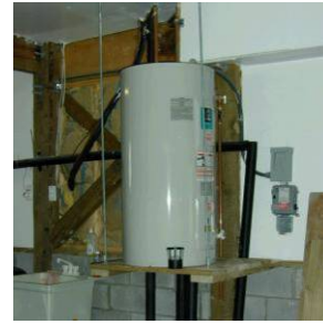
Elevating utilities in your basement like this hot water heater can save money that would otherwise have to be expended on replacement

In the long-run, action that gets people and property out of harm's way is the best way to protect people and communities from disasters rather than a detailed warning and evacuation system.