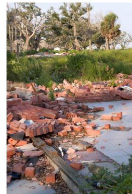
Following a disaster, faith-based responders offer hope as the presence of God – the one thing no other responder can bring to survivors.

The CWS Emergency Response Program assists disaster-affected persons through spiritual and physical support that empower local/regional/state religious leadership who want to work together toward building or restoring community. Although the CWS disaster response commitment comes from the imperative of the Gospel of Jesus Christ, its program invites and welcomes all religious groups to work together in meeting humanitarian needs.