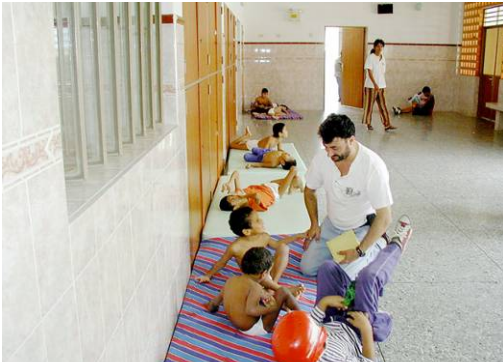
Medical and legal issues may continue for years – even generations – following technology-caused disasters.

The environment and public health as well as property are issues when technological systems breakdown due to human action -- i.e., an accidental oil spill, deliberate or careless release of dangerous chemicals, leaks from illegal or badly designed disposal areas for toxic waste or storage facilities for chemicals.