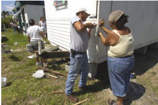
Working collaboratively, agencies expand their opportunity to assist survivors and stretch their resources to assist survivors most effectively and efficiently.

Interfaith or Faith-based Long-term Recovery Organization/Committee: In many situations, the faith community plays a significant role in the formation of the long term recovery group. Either the committee or organization model may be partially or wholly faith-based. Historically, the long-term recovery committee or organization was called an interfaith but this is much less the case now.